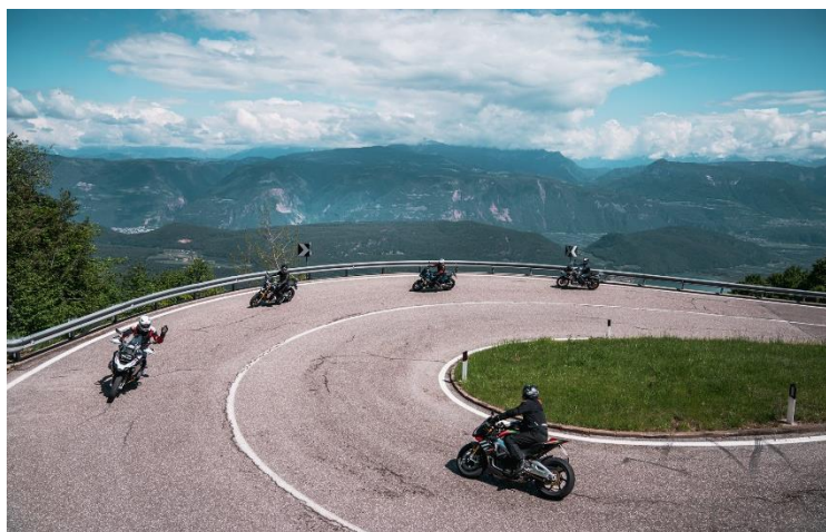
Picture 1: One day onroad program – Passo Mendola