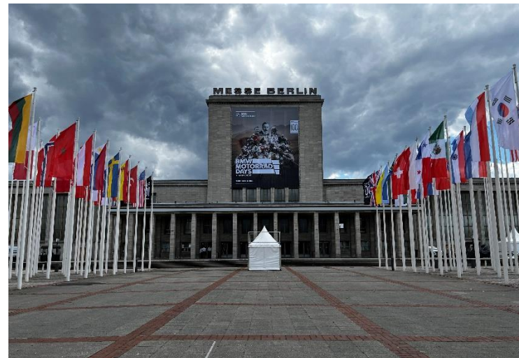
Picture 4: BMW Motorrad Days Berlin