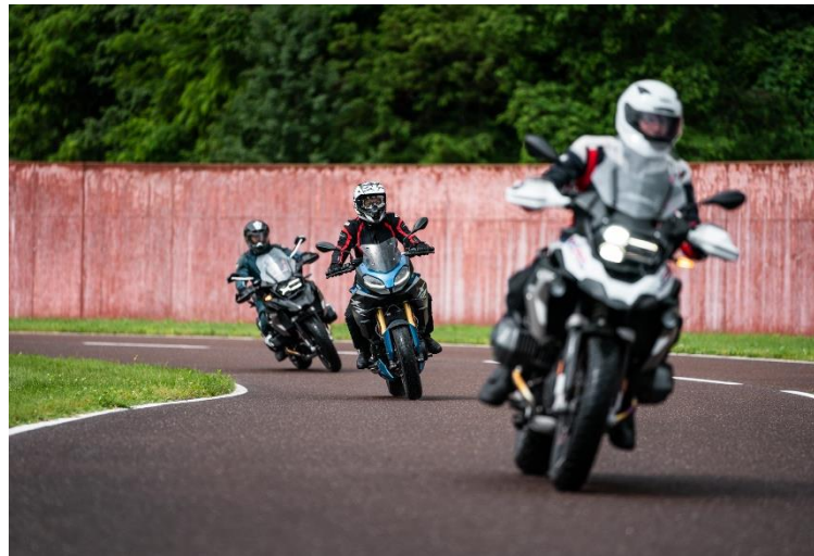
Picture 3: Training at Safety Park Alto Adige