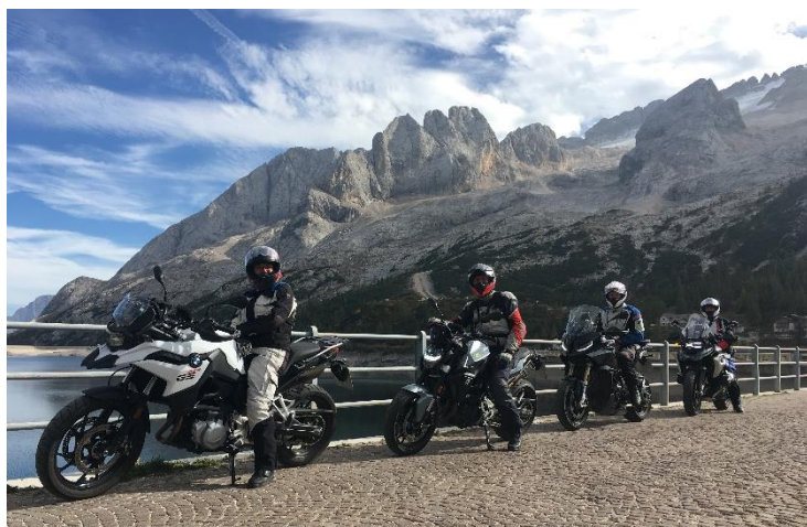
Picture 2: Last Ride of the Season