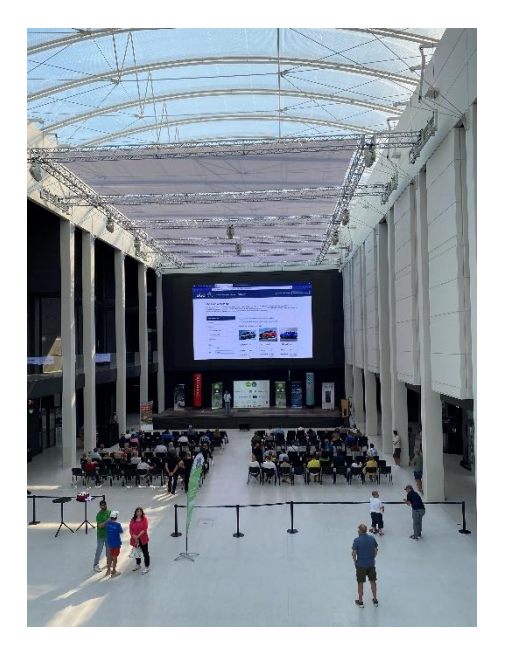
Photo 2: Afternoon Talks with Industry Experts Source: Riding Experience Alto Adige

Photo 1: Riding Experience Alto Adige Stand at the Eco-Dolomites event. Source: Riding Experience Alto Adige