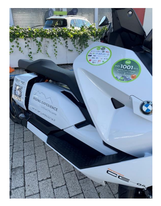
Photo 3: BMW CE-04 Available in the Riding Experience Alto Adige Fleet