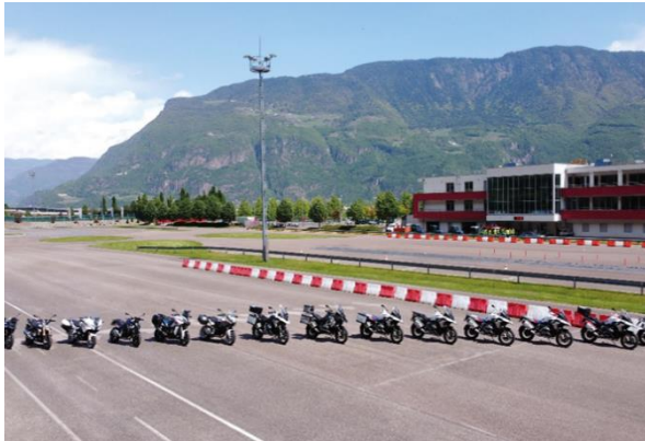
Image 1: The brand new BMW motorcycle fleet of the Riding Experience Alto Adige in front of the Safety Park Alto Adige and the characteristic, surrounding mountain scenery.