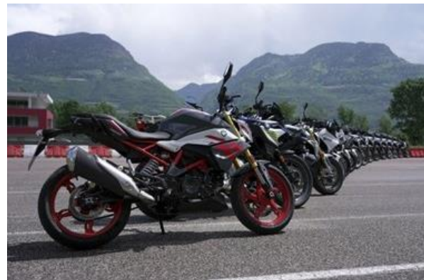
Image 4: There's something for everyone - a multifaceted pool of motorcycles ranging from sporty roadsters and comfortable touring cruisers to a variety of adventure models.