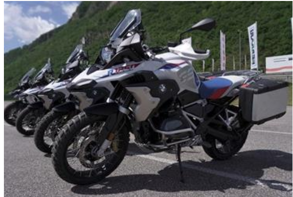
Image 2: BMW 1250 in various versions - the model focus of Riding Experience Alto Adige