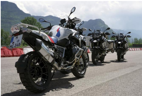
Image 3: Several BMW 1250 Adventure waiting for their first use in the mountains of South Tyrol